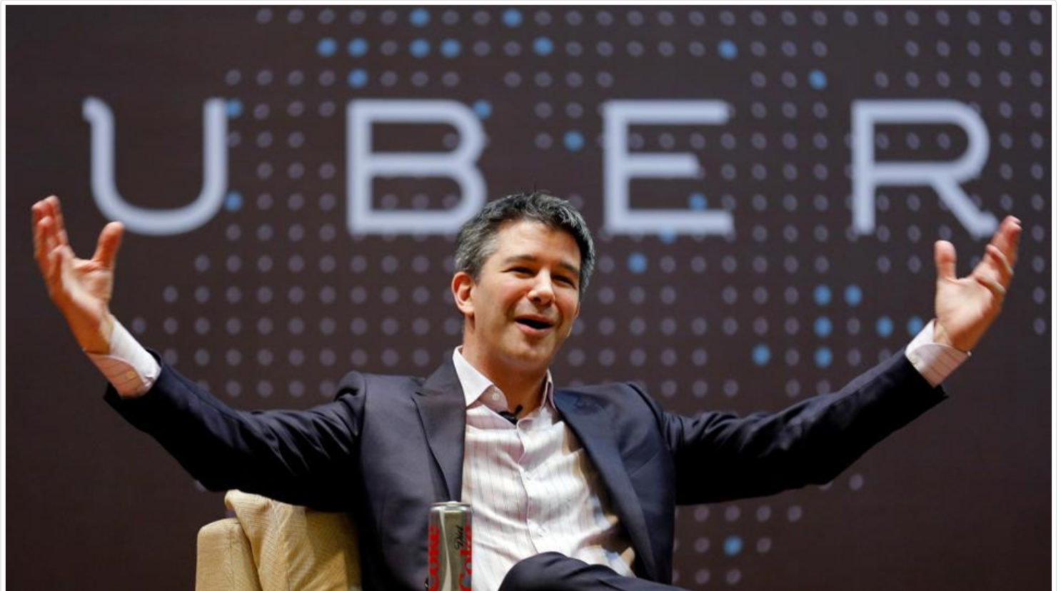
Uber CEO Travis Kalanick's resignation came after a probe into Uber's practices on tackling several issues.